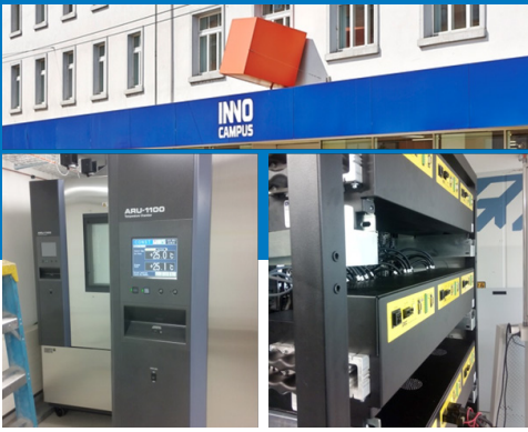
BFH-CSEM Energy Storage Research Center